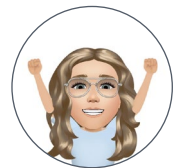
Miss Cambridge Teacher of English